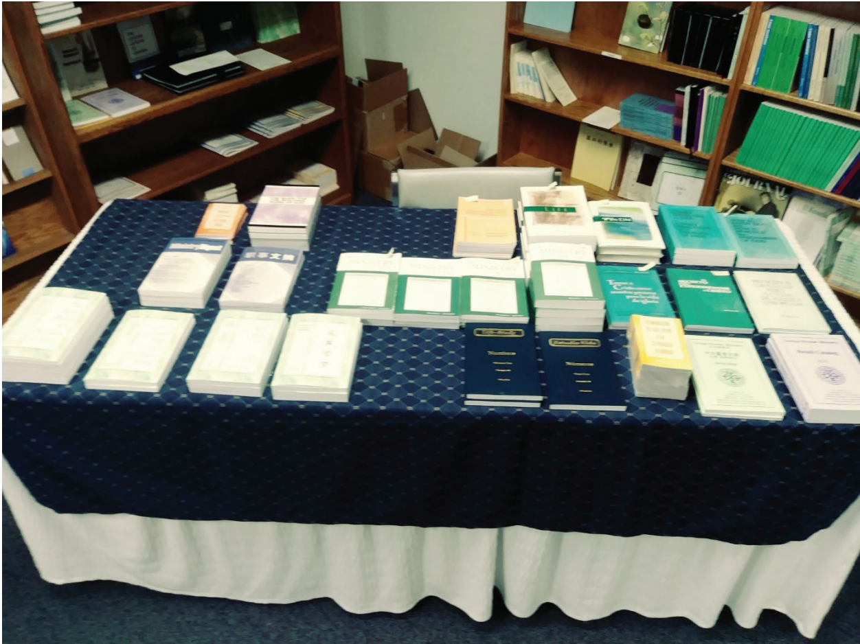
Book sales table