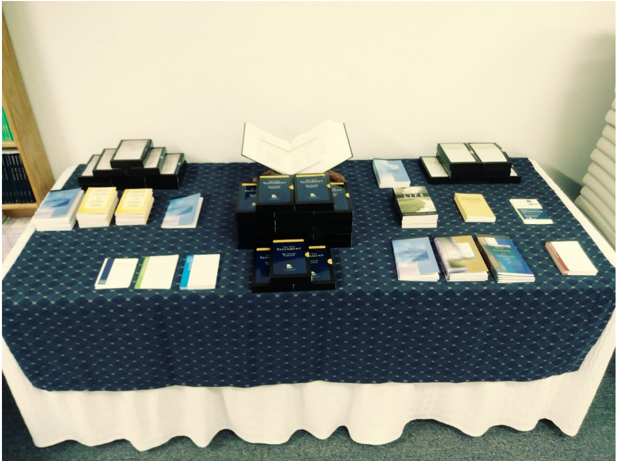
Free literature table