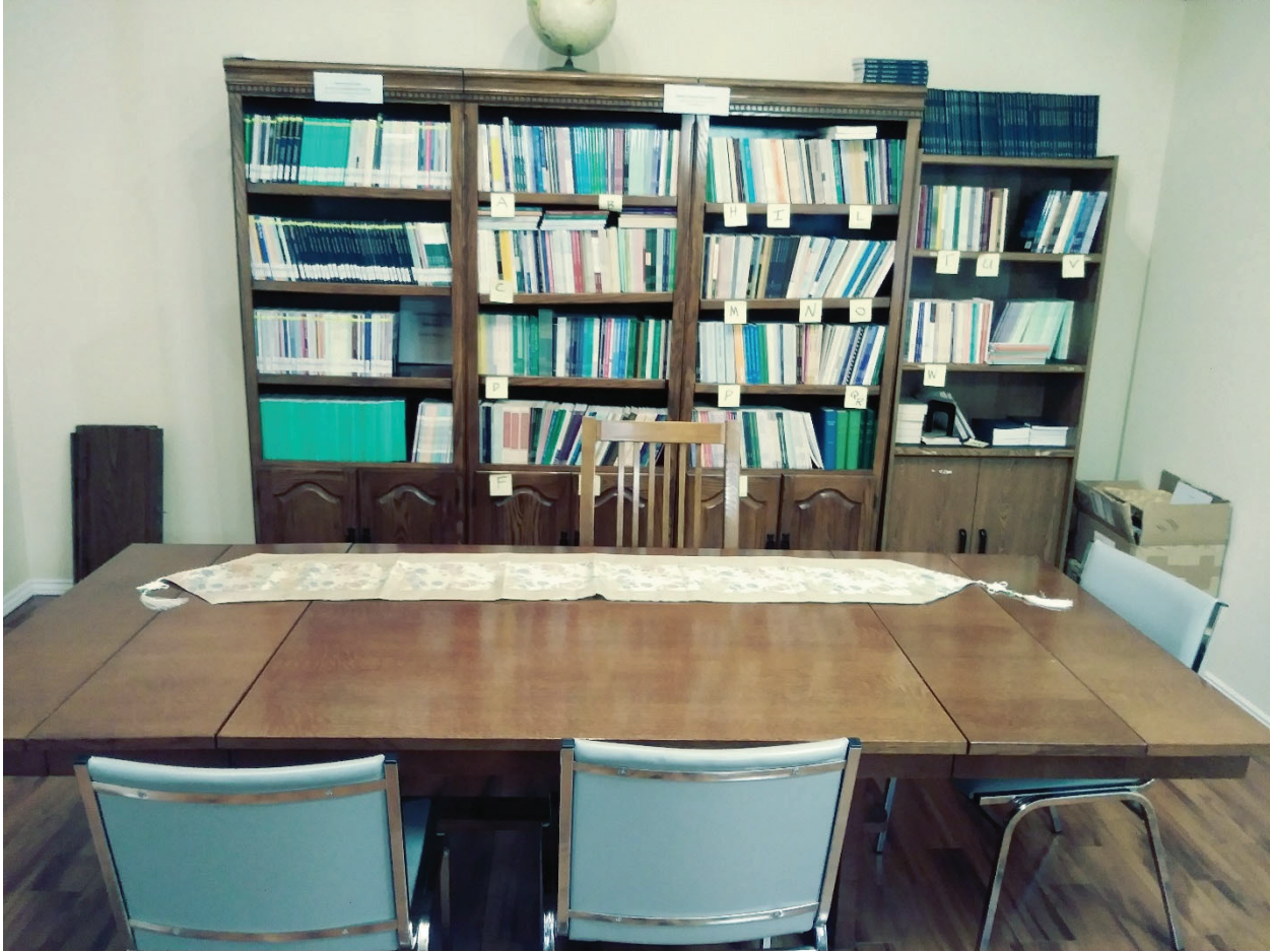
Free loan library