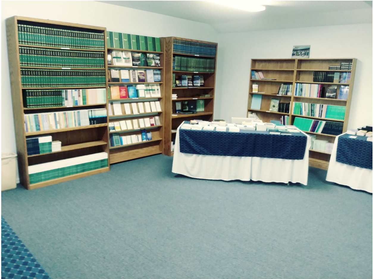
Book service area