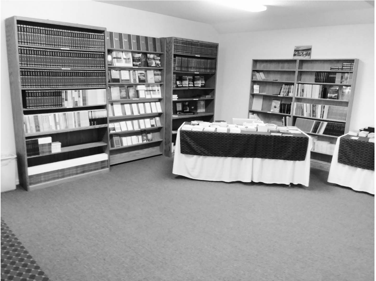
Book service area