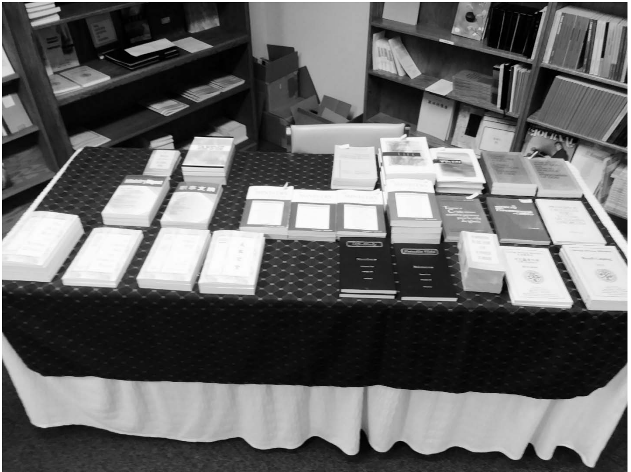
Book sales table