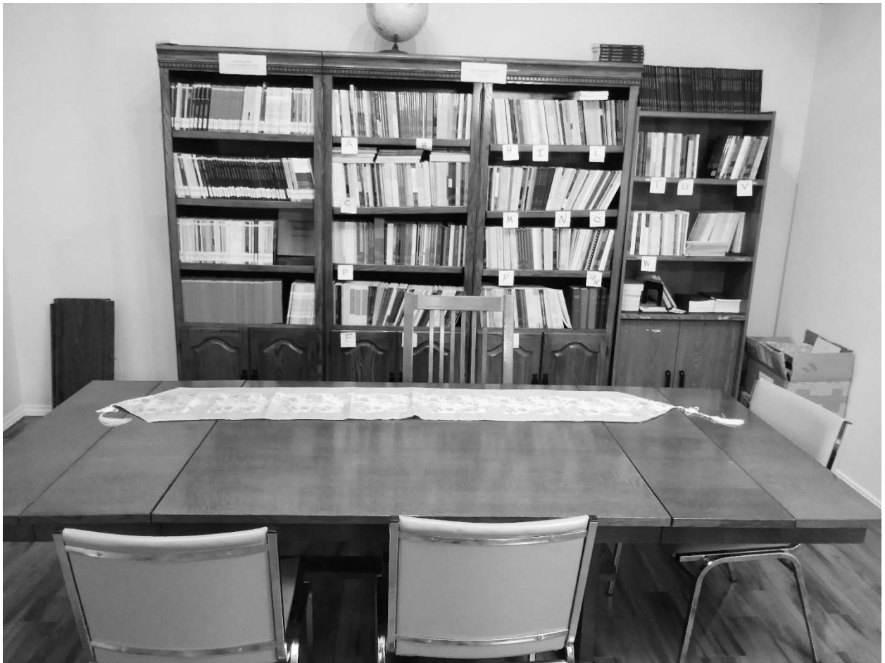
Free loan library